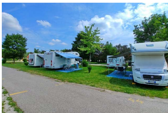
Terme Čatež - Camping