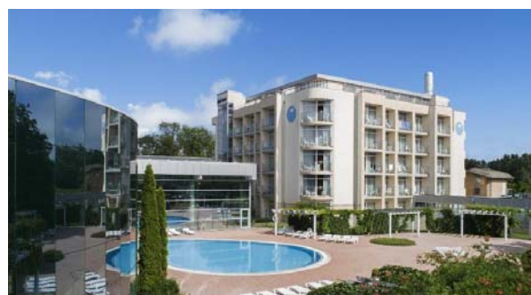
Terme Čatež - Hotel Čatež *** Bed & breakfast Half-board