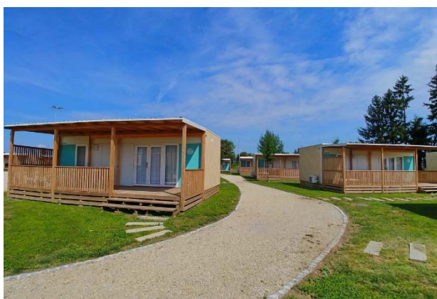
Terme Čatež - Mobile House