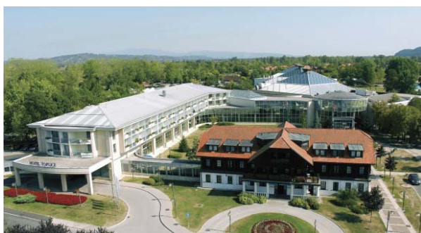
Terme Čatež - Hotel Toplice **** Bed & breakfast Half-board

Accommodation at Terme Čatež includes the use of the summer thermal riviera - free entry twice a day