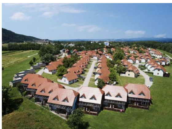
Terme Čatež - Apartments